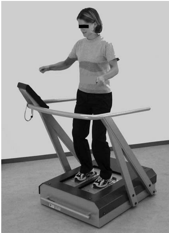
Figure 1 Multidimensional whole-body vibration device.

the rotation axis of the platform and the visual surround. The patients were instructed to stand upright and still with their arms hanging down laterally. Three repetitions of 20 s each were performed per subtest. From the obtained data a summary balance score was calculated. The values of the summary balance score were between 0 and 100, where values above 70 points were judged as 'normal' balance. This value represented the lower limit of a 95% confidence interval for healthy subjects (based on data from 112 healthy subjects). 20,21